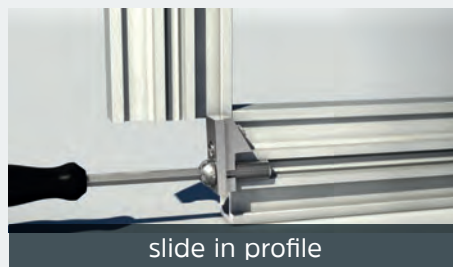
slide in profile