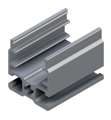
Profile 45 FRS 20.1152/0